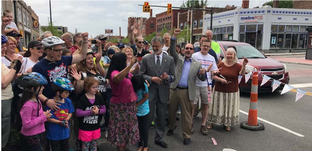
Cleveland community celebrates opening of new bike lane in Old Brooklyn with Mayor Frank Jackson.