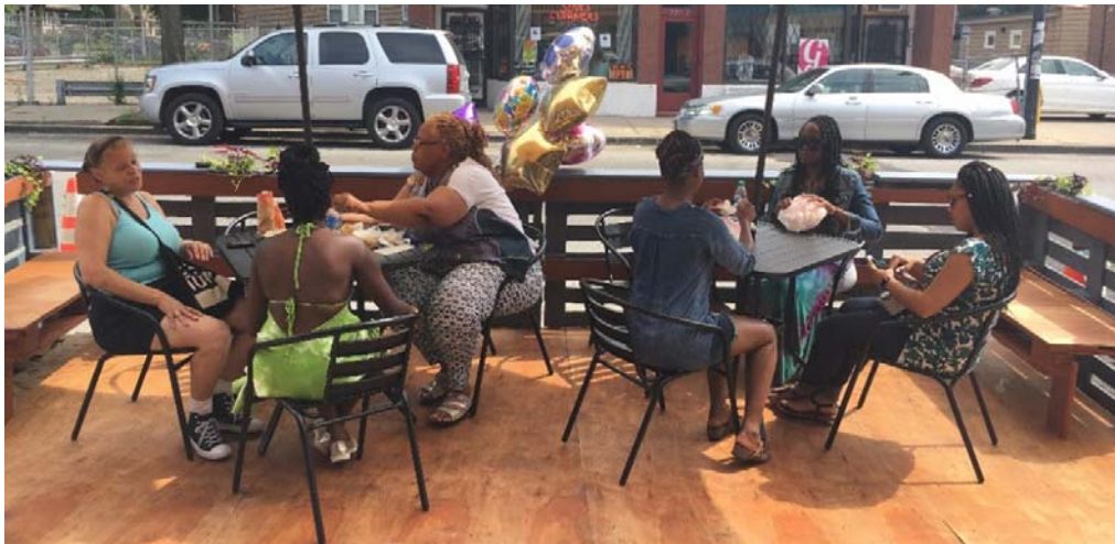
Parklet built by Greater Chatham Initiative to promote activity on 75th Street, on the Southside of Chicago.